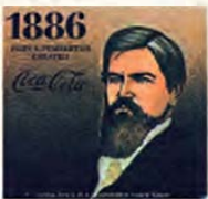
John Pemberton invents Coca Cola.

Goats Cheese Pearls coated in breadcrumb and deep fried, served on a bed of leaves and served with an onion chutney